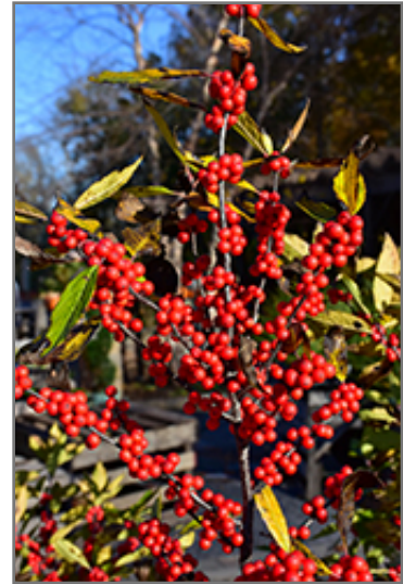
Winterberry fruit

This shrub will require occasional maintenance and upkeep, and is best pruned in late winter once the threat of extreme cold has passed. It is a good choice for attracting birds to your yard. Gardeners should be aware of the following characteristic(s) that may warrant special consideration;