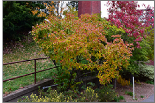
Winterberry in fall

This shrub does best in full sun to partial shade. It prefers to grow in moist to wet soil, and will even tolerate some standing water. It is very fussy about its soil conditions and must have rich, acidic soils to ensure success, and is subject to chlorosis (yellowing) of the foliage in alkaline soils. It is somewhat tolerant of urban pollution. Consider applying a thick mulch around the root zone in winter to protect it in exposed locations or colder microclimates. This species is native to parts of North America.