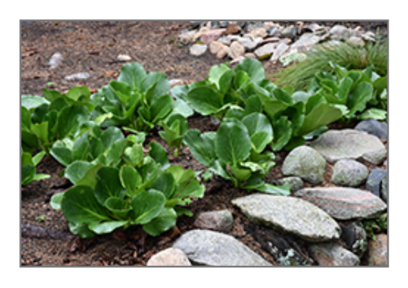
Heartleaf Bergenia

Heartleaf Bergenia will grow to be about 12 inches tall at maturity, with a spread of 18 inches. Its foliage tends to remain dense right to the ground, not requiring facer plants in front. It grows at a medium rate, and under ideal conditions can be expected to live for approximately 10 years. As an evegreen perennial, this plant will typically keep its form and foliage year-round.