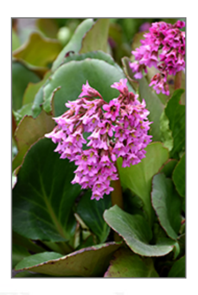
Heartleaf Bergenia flowers

This is a relatively low maintenance plant, and is best cleaned up in early spring before it resumes active growth for the season. Deer don't particularly care for this plant and will usually leave it alone in favor of tastier treats. It has no significant negative characteristics.