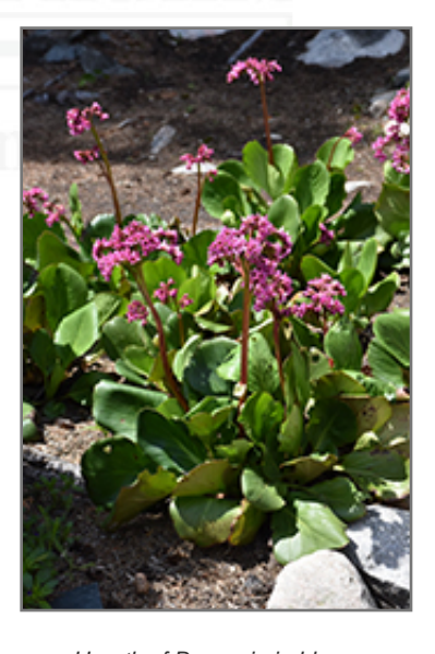
Heartleaf Bergenia in bloom