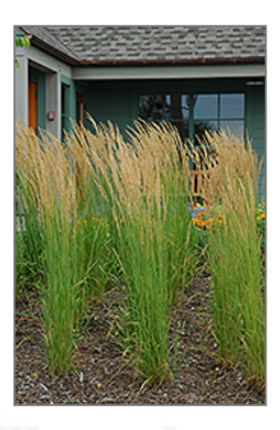
Karl Foerster Reed Grass

Karl Foerster Reed Grass is recommended for the following landscape applications;