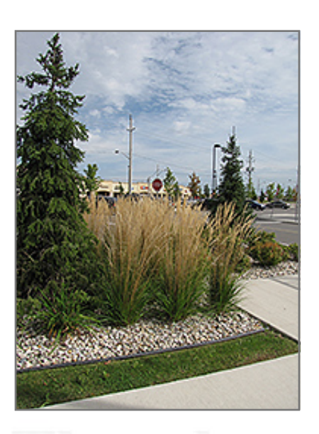
Karl Foerster Reed Grass in bloom

This plant does best in full sun to partial shade. It is very adaptable to both dry and moist locations, and should do just fine under typical garden conditions. It is not particular as to soil type or pH. It is highly tolerant of urban pollution and will even thrive in inner city environments. This particular variety is an interspecific hybrid. It can be propagated by division; however, as a cultivated variety, be aware that it may be subject to certain restrictions or prohibitions on propagation.