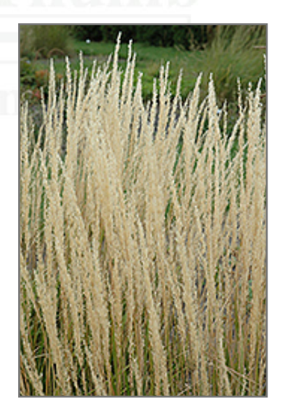
Karl Foerster Reed Grass flowers