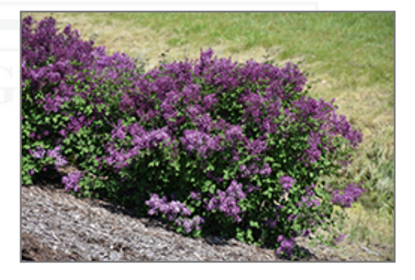
Bloomerang Dark Purple Lilac in bloom

Bloomerang Dark Purple Lilac is recommended for the following landscape applications;