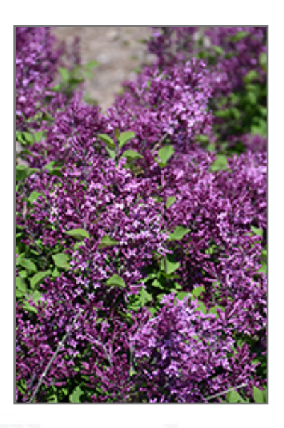
Bloomerang Dark Purple Lilac flowers

This is a relatively low maintenance shrub, and should only be pruned after flowering to avoid removing any of the current season's flowers. It is a good choice for attracting butterflies to your yard. It has no significant negative characteristics.