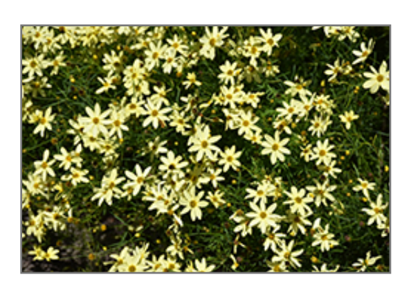
Moonbeam Tickseed flowers

A beautiful compact mounded and drought tolerant variety that features fine, ferny foliage covered in soft buttery yellow flowers; blooms from early to late summer; an excellent addition to beds, borders or containers; thrives in poor, sandy soils