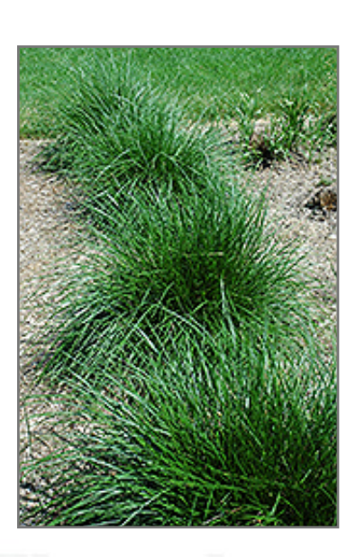
Tufted Hair Grass

An easy to grow, cool season variety that features mounds of dark green, grass-like foliage with purple-green, feathery panicles rising above in the early summer months; great for adding height and texture to borders, beds and containers