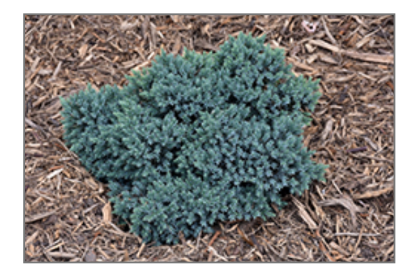
Blue Star Juniper

Blue Star Juniper is recommended for the following landscape applications;