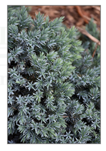
Blue Star Juniper foliage