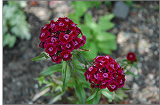
Sweet William flowers