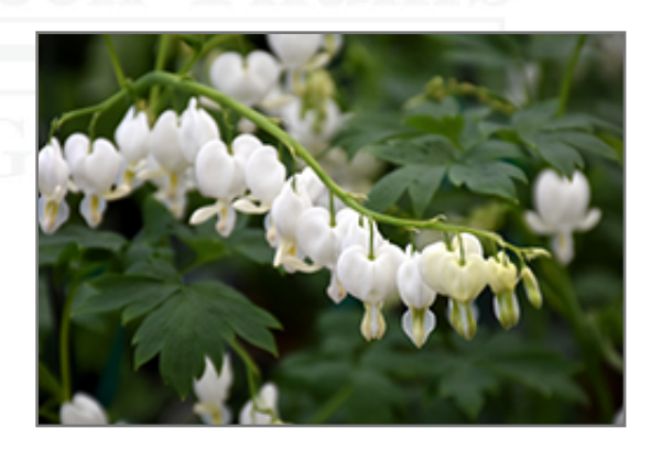
White Bleeding Heart flowers