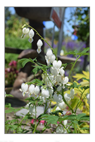
White Bleeding Heart flowers

White Bleeding Heart is recommended for the following landscape applications;