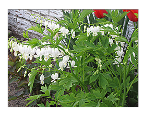
White Bleeding Heart in bloom

White Bleeding Heart will grow to be about 32 inches tall at maturity, with a spread of 3 feet. When grown in masses or used as a bedding plant, individual plants should be spaced approximately 30 inches apart. It grows at a medium rate, and under ideal conditions can be expected to live for approximately 15 years. As an herbaceous perennial, this plant will usually die back to the crown each winter, and will regrow from the base each spring. Be careful not to disturb the crown in late winter when it may not be readily seen! As this plant tends to go dormant in summer, it is best interplanted with late-season bloomers to hide the dying foliage.