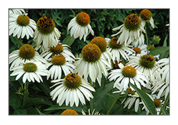
White Swan Coneflower flowers

White Swan Coneflower is an herbaceous perennial with an upright spreading habit of growth. Its medium texture blends into the garden, but can always be balanced by a couple of finer or coarser plants for an effective composition.