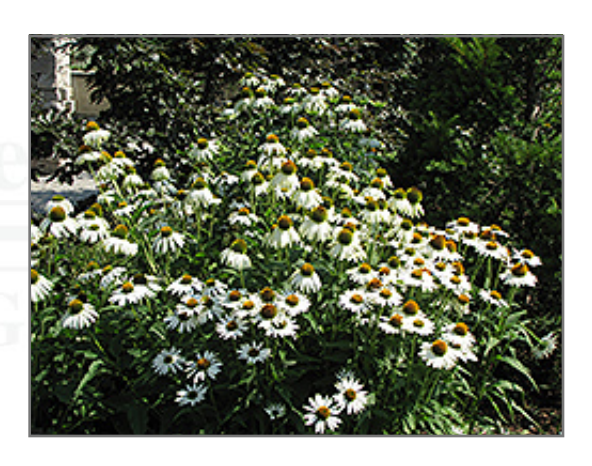
White Swan Coneflower in bloom

This is a relatively low maintenance plant, and is best cleaned up in early spring before it resumes active growth for the season. It is a good choice for attracting butterflies to your yard, but is not particularly attractive to deer who tend to leave it alone in favor of tastier treats. It has no significant negative characteristics.