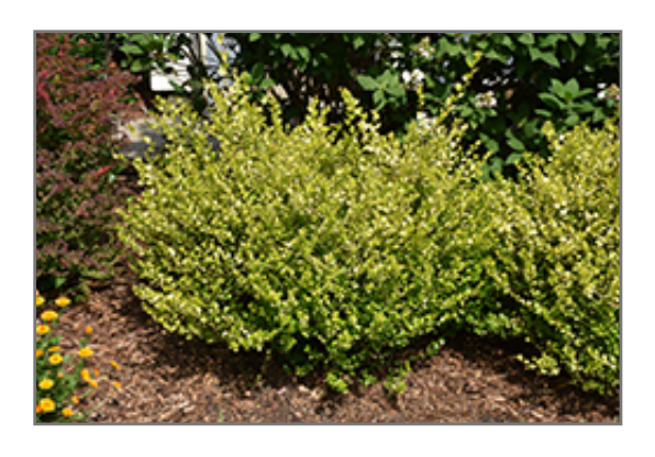
Cesky Gold Dwarf Birch

Cesky Gold Dwarf Birch is recommended for the following landscape applications;