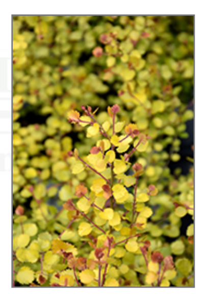
Cesky Gold Dwarf Birch foliage