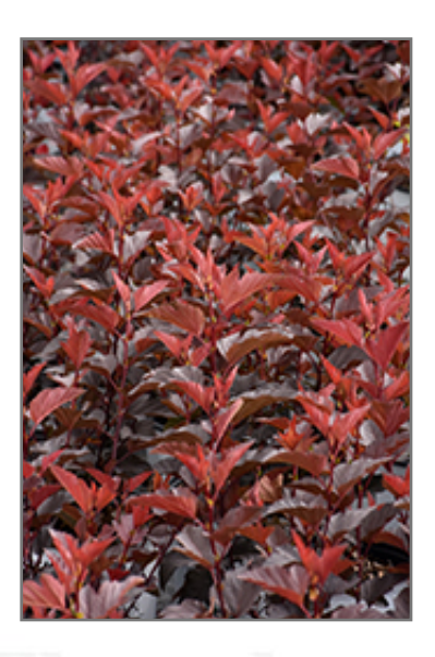
Ginger Wine Ninebark foliage

This shrub does best in full sun to partial shade. It is very adaptable to both dry and moist locations, and should do just fine under average home landscape conditions. It is not particular as to soil type or pH. It is highly tolerant of urban pollution and will even thrive in inner city environments. This is a selection of a native North American species.