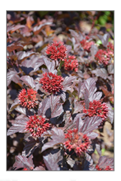
Ginger Wine Ninebark flower buds

Ginger Wine Ninebark is a multi-stemmed deciduous shrub with a more or less rounded form. Its relatively fine texture sets it apart from other landscape plants with less refined foliage.