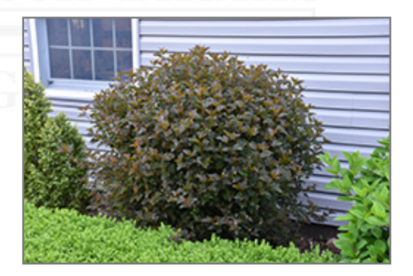
Ginger Wine Ninebark