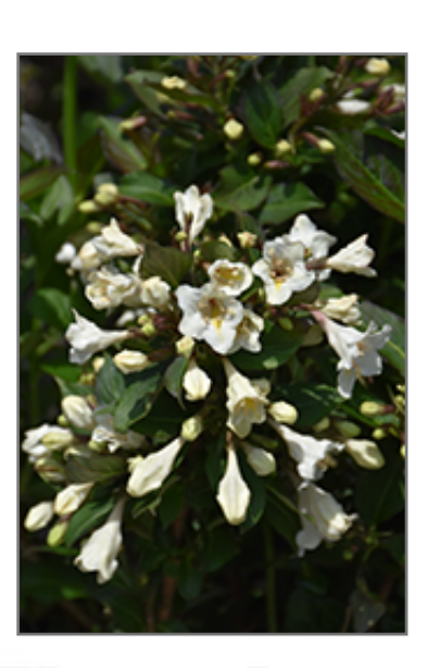
Tuxedo Weigela flowers

A beautiful shrub that blooms all summer, into fall, featuring contrasting white trumpet-shaped flowers, against deep green, almost black foliage; attracts butterflies; great for the back of flower beds, or for patio pots; deadhead to promote re-blooming