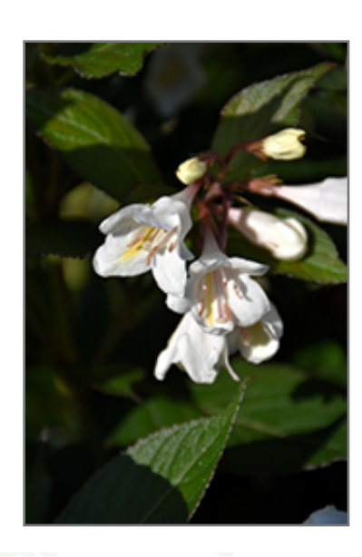
Tuxedo Weigela flowers

Tuxedo Weigela makes a fine choice for the outdoor landscape, but it is also well-suited for use in outdoor pots and containers. Because of its height, it is often used as a 'thriller' in the 'spiller-thriller-filler' container combination; plant it near the center of the pot, surrounded by smaller plants and those that spill over the edges. It is even sizeable enough that it can be grown alone in a suitable container. Note that when grown in a container, it may not perform exactly as indicated on the tag - this is to be expected. Also note that when growing plants in outdoor containers and baskets, they may require more frequent waterings than they would in the yard or garden. Be aware that in our climate, most plants cannot be expected to survive the winter if left in containers outdoors, and this plant is no exception. Contact our experts for more information on how to protect it over the winter months.