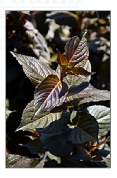
Tuxedo Weigela foliage

Tuxedo Weigela is recommended for the following landscape applications;