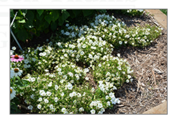
Rapido White Bellflower in bloom

Rapido White Bellflower is recommended for the following landscape applications;