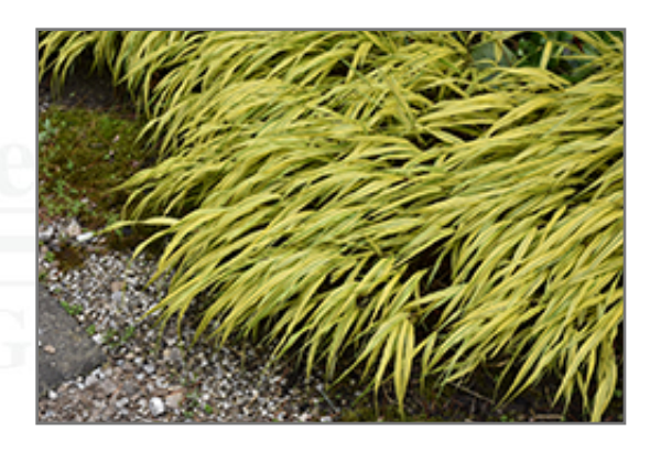
Golden Variegated Hakone Grass

This is a relatively low maintenance plant, and usually looks its best without pruning, although it will tolerate pruning. It has no significant negative characteristics.