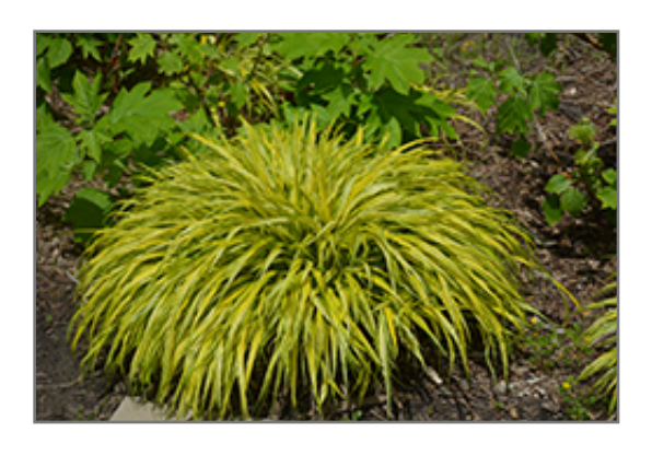
Golden Variegated Hakone Grass

Golden Variegated Hakone Grass is a dense herbaceous perennial with a shapely form and gracefully arching foliage. It brings an extremely fine and delicate texture to the garden composition and should be used to full effect.