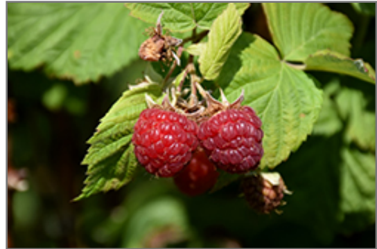
Nova Raspberry fruit

Nova Raspberry has rich green deciduous foliage on a plant with an upright spreading habit of growth. The fuzzy oval compound leaves do not develop any appreciable fall colour. It features an abundance of magnificent red berries in mid summer.