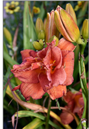
Double Moses Fire Daylily flowers

A vibrant orangy-red double daylily with ruffled edges; sturdy, strong, easy to care for, great grassy texture and form; good for the beginner gardener and the pro