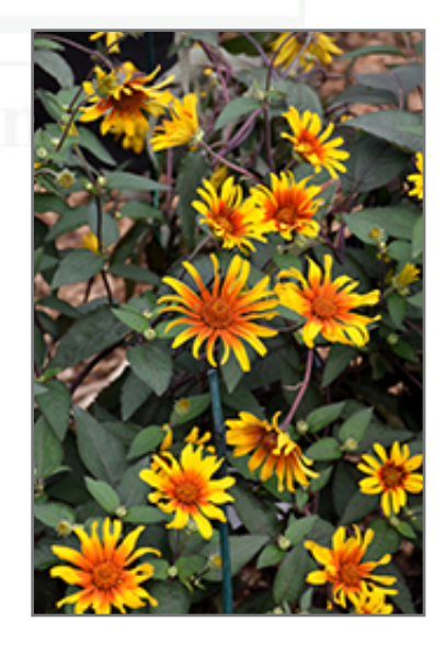
Burning Hearts False Sunflower flowers