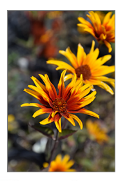
Burning Hearts False Sunflower flowers

Burning Hearts False Sunflower is an herbaceous perennial with an upright spreading habit of growth. Its medium texture blends into the garden, but can always be balanced by a couple of finer or coarser plants for an effective composition.