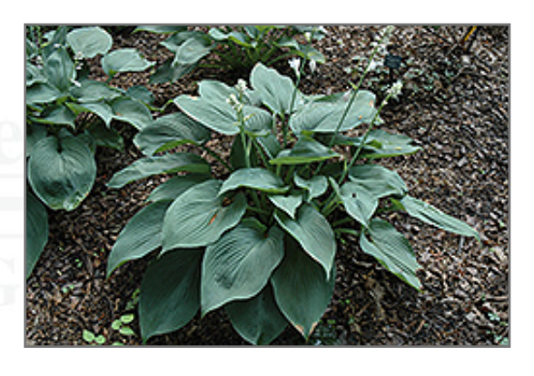
Blue Angel Hosta in bloom