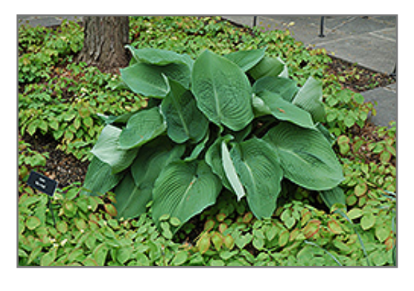
Blue Angel Hosta

Blue Angel Hosta features dainty spikes of lavender bell-shaped flowers rising above the foliage in mid summer. Its attractive enormous textured heart-shaped leaves emerge blue in spring, turning bluish-green in colour throughout the season.