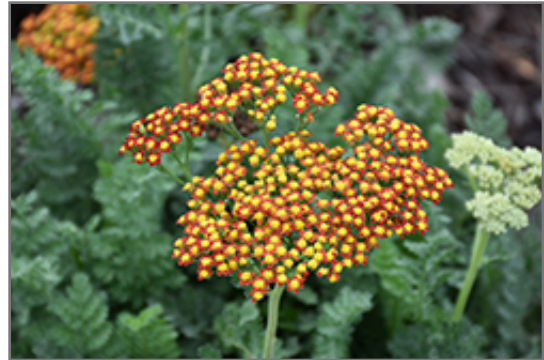
Sassy Summer Sunset Yarrow flowers Photo courtesy of NetPS Plant Finder

Sassy Summer Sunset Yarrow is recommended for the following landscape applications;