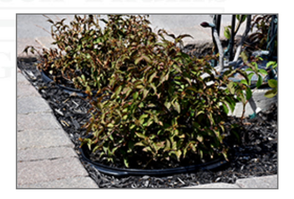
Nightglow Diervilla