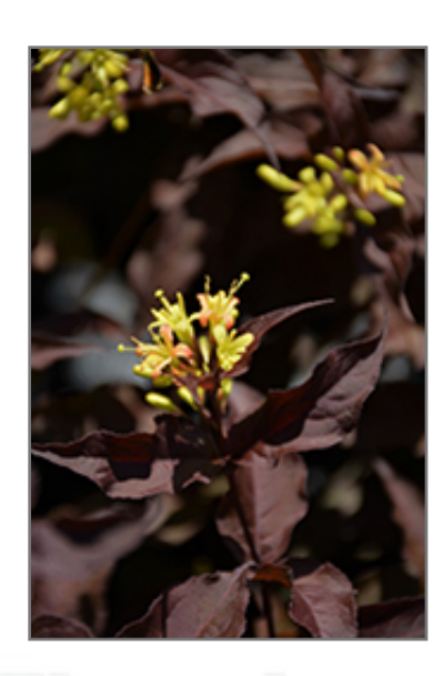
Nightglow Diervilla flowers

Nightglow Diervilla is a dense multi-stemmed deciduous shrub with a mounded form. Its average texture blends into the landscape, but can be balanced by one or two finer or coarser trees or shrubs for an effective composition.