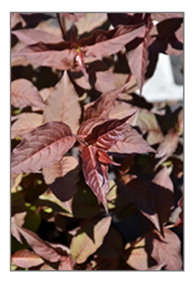
Nightglow Diervilla foliage

Nightglow Diervilla will grow to be about 3 feet tall at maturity, with a spread of 3 feet. It tends to fill out right to the ground and therefore doesn't necessarily require facer plants in front. It grows at a medium rate, and under ideal conditions can be expected to live for approximately 20 years.