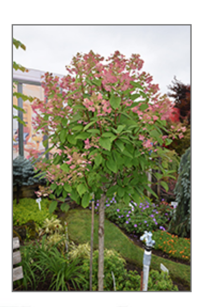
Quick Fire Hydrangea (tree form) (topiary form)