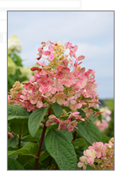
Quick Fire Hydrangea (tree form) flowers