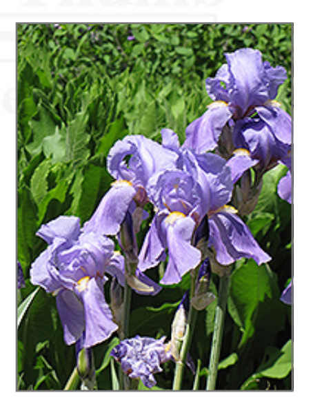
Golden Variegated Sweet Iris flowers