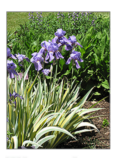
Golden Variegated Sweet Iris in bloom

Golden Variegated Sweet Iris is recommended for the following landscape applications;