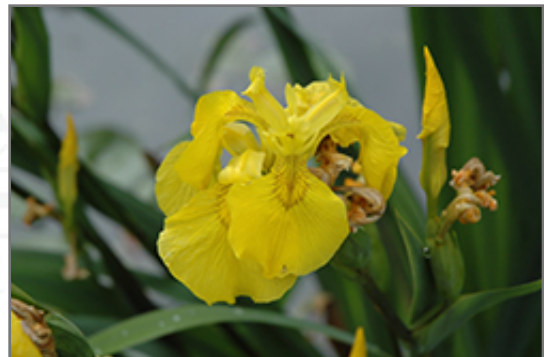
Yellow Flag Iris flowers