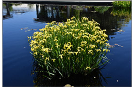
Yellow Flag Iris in bloom

Yellow Flag Iris is recommended for the following landscape applications;