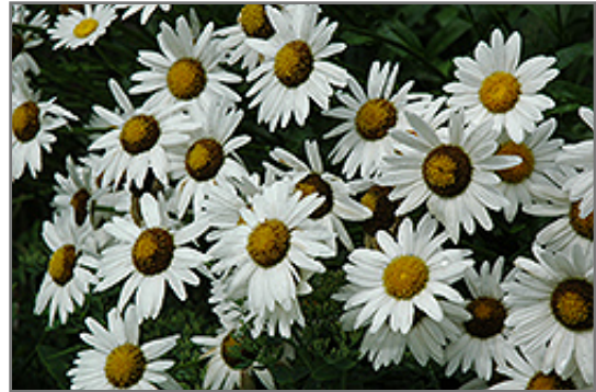
Alaska Shasta Daisy flowers