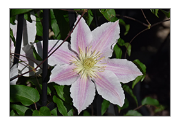
Vancouver Cotton Candy Clematis flowers