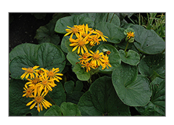
Desdemona Rayflower flowers

Desdemona Rayflower features bold panicles of gold daisy flowers at the ends of the stems from late summer to early fall. Its attractive large serrated round leaves emerge deep purple in spring, turning dark green in colour with curious purple undersides and tinges of deep purple throughout the season.