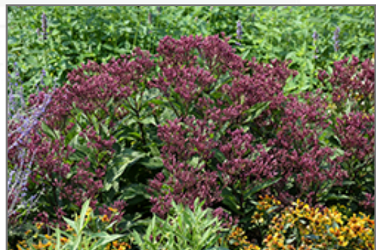
Euphoria Ruby Joe Pye Weed in bloom