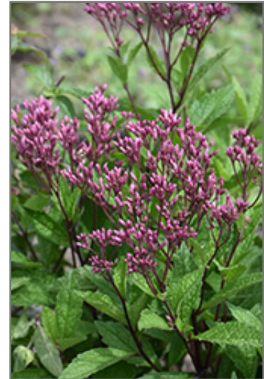
Euphoria Ruby Joe Pye Weed flower buds

This plant does best in full sun to partial shade. It prefers to grow in average to dry locations, and dislikes excessive moisture. It is not particular as to soil type or pH. It is somewhat tolerant of urban pollution. This is a selection of a native North American species. It can be propagated by division; however, as a cultivated variety, be aware that it may be subject to certain restrictions or prohibitions on propagation.