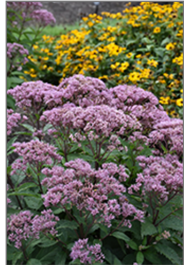
Euphoria Ruby Joe Pye Weed flowers

Euphoria Ruby Joe Pye Weed is an herbaceous perennial with an upright spreading habit of growth. Its wonderfully bold, coarse texture can be very effective in a balanced garden composition.