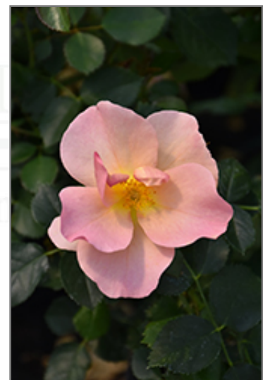
Chinook Rose flowers