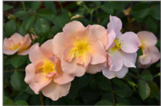
Chinook Rose flowers

This is a high maintenance shrub that will require regular care and upkeep, and is best pruned in late winter once the threat of extreme cold has passed. Gardeners should be aware of the following characteristic(s) that may warrant special consideration;