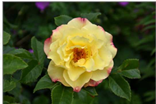
Rugelda Rose flowers