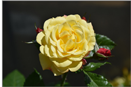
Rugelda Rose flowers

This is a high maintenance shrub that will require regular care and upkeep, and is best pruned in late winter once the threat of extreme cold has passed. It is a good choice for attracting bees to your yard. Gardeners should be aware of the following characteristic(s) that may warrant special consideration;