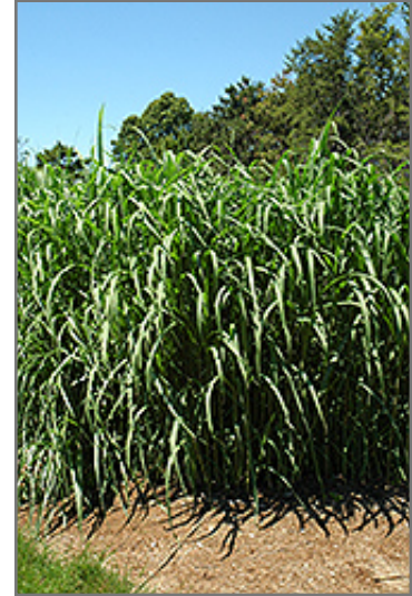
Giant Silver Grass