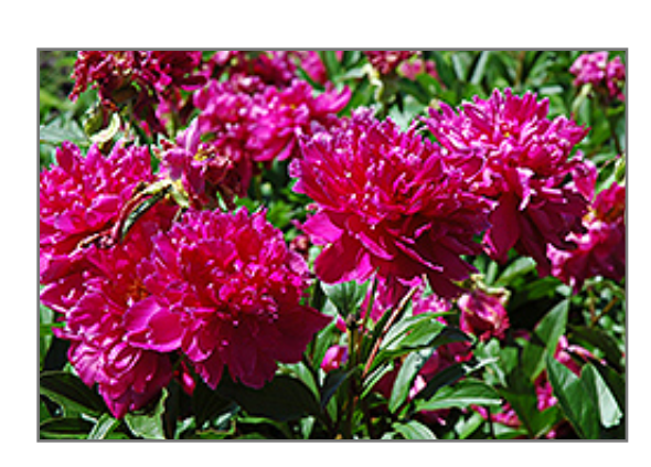
Karl Rosenfield Peony flowers

Karl Rosenfield Peony features bold lightly-scented fuchsia flowers with yellow anthers at the ends of the stems from late spring to early summer. The flowers are excellent for cutting. Its compound leaves remain green in colour throughout the season.