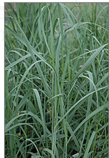
Heavy Metal Blue Switch Grass foliage