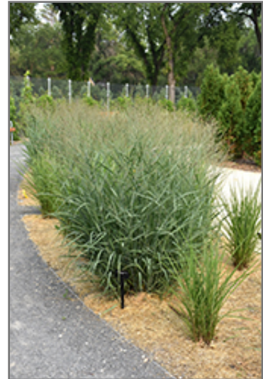
Heavy Metal Blue Switch Grass