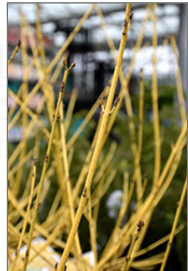
Arctic Fire Yellow Dogwood stems