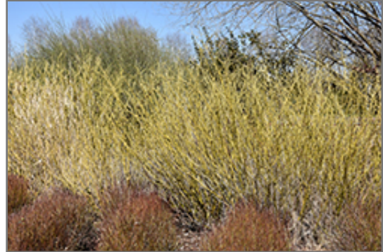
Arctic Fire Yellow Dogwood in winter

Arctic Fire Yellow Dogwood is a multi-stemmed deciduous shrub with an upright spreading habit of growth. Its average texture blends into the landscape, but can be balanced by one or two finer or coarser trees or shrubs for an effective composition.