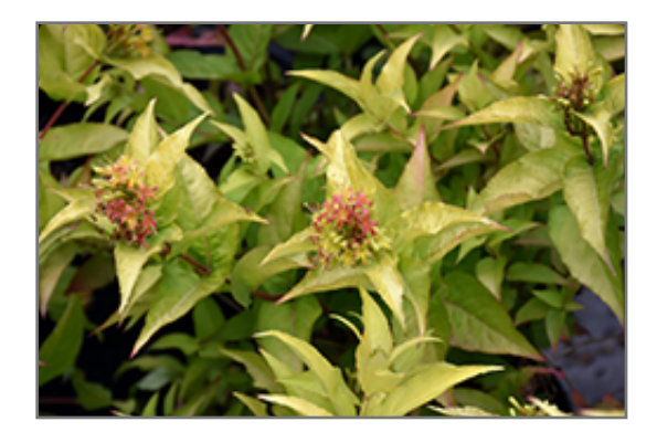
Honeybee Bush Honeysuckle flowers

This shrub will require occasional maintenance and upkeep, and is best pruned in late winter once the threat of extreme cold has passed. It is a good choice for attracting bees and butterflies to your yard. Gardeners should be aware of the following characteristic(s) that may warrant special consideration;