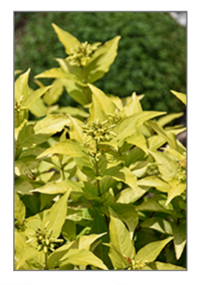
Honeybee Bush Honeysuckle flower buds

This shrub does best in full sun to partial shade. It is very adaptable to both dry and moist growing conditions, but will not tolerate any standing water. It is not particular as to soil type or pH. It is somewhat tolerant of urban pollution. This is a selection of a native North American species.