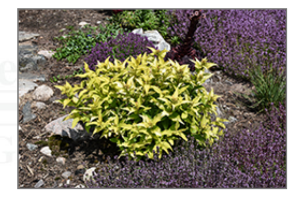
Honeybee Bush Honeysuckle in bloom