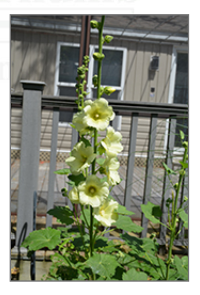
Spotlight Sunshine Hollyhock in bloom

This is a high maintenance plant that will require regular care and upkeep, and should only be pruned after flowering to avoid removing any of the current season's flowers. It is a good choice for attracting hummingbirds to your yard, but is not particularly attractive to deer who tend to leave it alone in favor of tastier treats. Gardeners should be aware of the following characteristic(s) that may warrant special consideration;