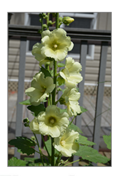
Spotlight Sunshine Hollyhock flowers

Stunning bright yellow single flowers, on tall, sturdy stalks in midsummer; this biennial is tolerant to the natural toxin formed by the roots of Black Walnut, but can be susceptible to Japanese beetles; plant in full sun for better growth