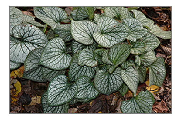
Jack Frost Bugloss foliage

Jack Frost Bugloss is an herbaceous perennial with a mounded form. Its relatively coarse texture can be used to stand it apart from other garden plants with finer foliage.