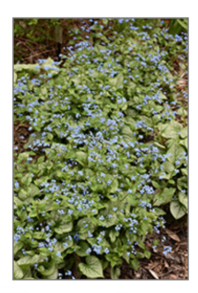
Jack Frost Bugloss in bloom

Jack Frost Bugloss is a fine choice for the garden, but it is also a good selection for planting in outdoor pots and containers. It is often used as a 'filler' in the 'spiller-thriller-filler' container combination, providing a mass of flowers and foliage against which the thriller plants stand out. Note that when growing plants in outdoor containers and baskets, they may require more frequent waterings than they would in the yard or garden. Be aware that in our climate, most plants cannot be expected to survive the winter if left in containers outdoors, and this plant is no exception. Contact our experts for more information on how to protect it over the winter months.