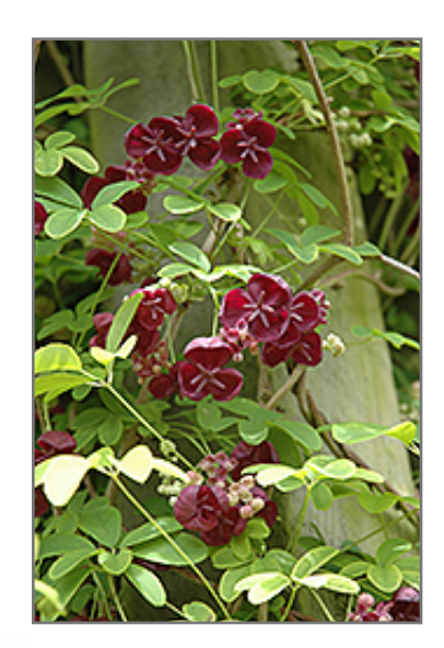
Fiveleaf Akebia flowers

Fiveleaf Akebia is a multi-stemmed deciduous woody vine with a twining and trailing habit of growth. Its relatively fine texture sets it apart from other landscape plants with less refined foliage.