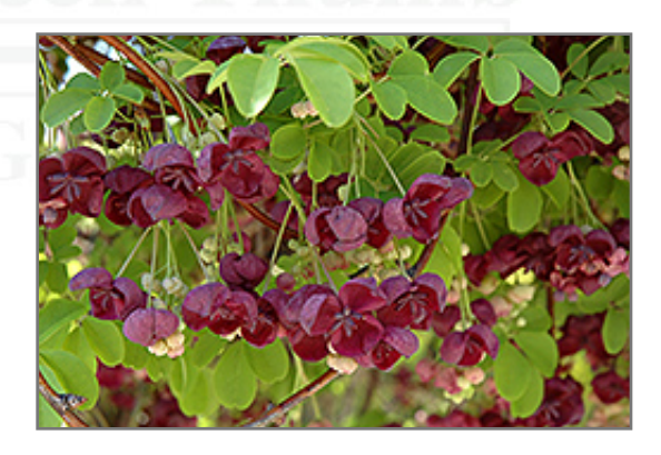
Fiveleaf Akebia flowers