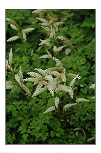
Dwarf Goatsbeard flowers

This is a relatively low maintenance plant, and is best cleaned up in early spring before it resumes active growth for the season. Deer don't particularly care for this plant and will usually leave it alone in favor of tastier treats. It has no significant negative characteristics.