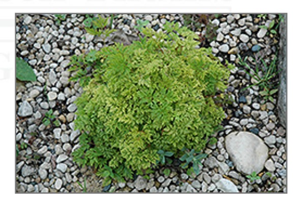
Dwarf Goatsbeard