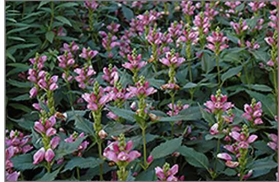
Pink Turtlehead flowers