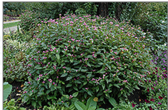
Pink Turtlehead in bloom