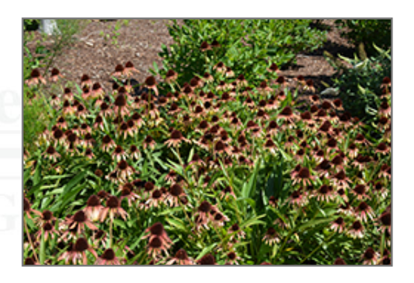
Fiery Meadow Mama Coneflower flowers