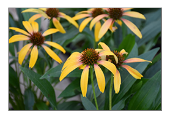
Fiery Meadow Mama Coneflower flowers

Fiery Meadow Mama Coneflower has masses of beautiful lightly-scented yellow daisy flowers with brick red eyes and a red ring at the ends of the stems from mid summer to mid fall, which are most effective when planted in groupings. The flowers are excellent for cutting. Its pointy leaves remain olive green in colour throughout the season.