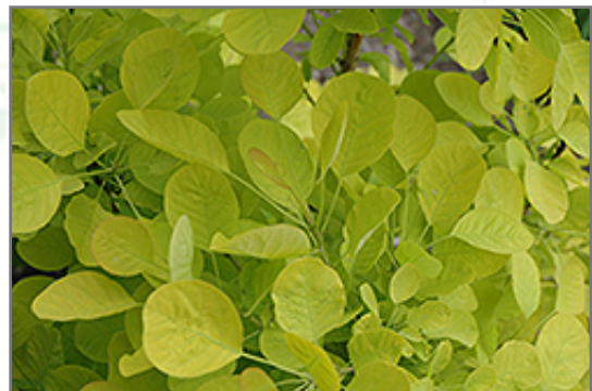
Golden Spirit Smokebush foliage