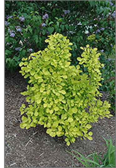
Golden Spirit Smokebush

Golden Spirit Smokebush is a multi-stemmed deciduous shrub with an upright spreading habit of growth. Its average texture blends into the landscape, but can be balanced by one or two finer or coarser trees or shrubs for an effective composition.