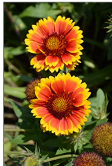
Arizona Sun Blanket Flower flowers

This plant will require occasional maintenance and upkeep, and is best cleaned up in early spring before it resumes active growth for the season. It is a good choice for attracting bees and butterflies to your yard, but is not particularly attractive to deer who tend to leave it alone in favor of tastier treats. It has no significant negative characteristics.