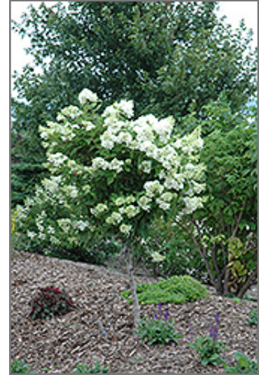
Pink Diamond Hydrangea (tree form) in bloom