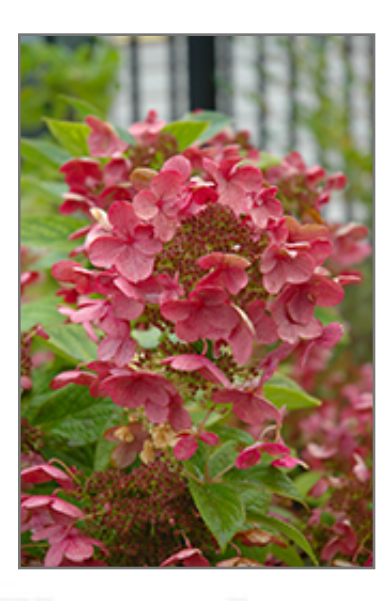
Quick Fire Hydrangea flowers (faded)

This shrub performs well in both full sun and full shade. It prefers to grow in average to moist conditions, and shouldn't be allowed to dry out. It is not particular as to soil type or pH. It is highly tolerant of urban pollution and will even thrive in inner city environments. Consider applying a thick mulch around the root zone in winter to protect it in exposed locations or colder microclimates. This is a selected variety of a species not originally from North America.