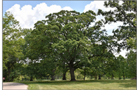
White Oak

This tree will require occasional maintenance and upkeep, and is best pruned in late winter once the threat of extreme cold has passed. It is a good choice for attracting squirrels to your yard. Gardeners should be aware of the following characteristic(s) that may warrant special consideration;