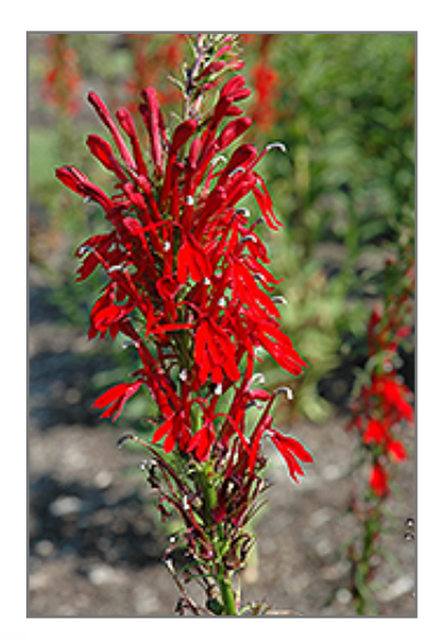
Cardinal Flower flowers