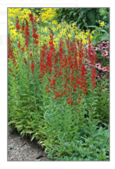
Cardinal Flower in bloom