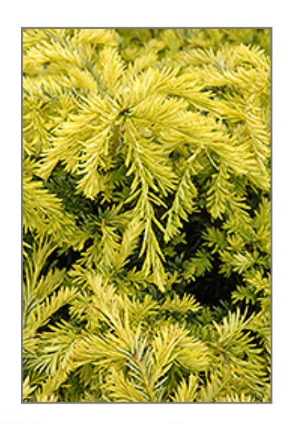
Sunburst Yew foliage