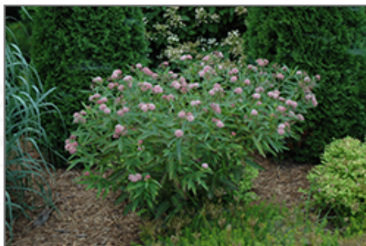
Cinderella Milkweed in bloom