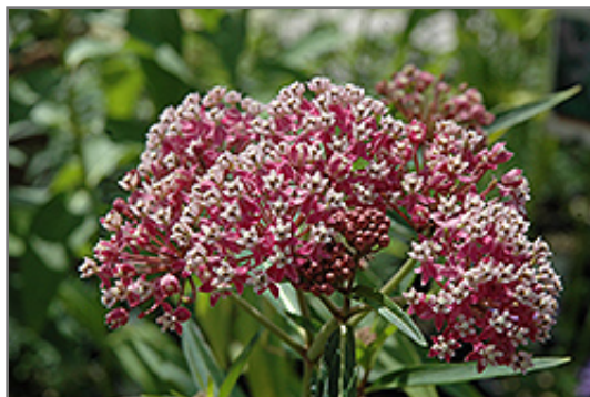
Cinderella Milkweed flowers

This is a relatively low maintenance plant, and is best cleaned up in early spring before it resumes active growth for the season. It is a good choice for attracting butterflies to your yard, but is not particularly attractive to deer who tend to leave it alone in favor of tastier treats. It has no significant negative characteristics.