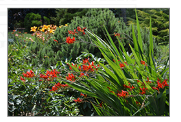
Lucifer Crocosmia in bloom