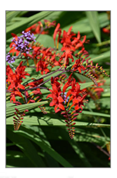
Lucifer Crocosmia flowers

Lucifer Crocosmia is an herbaceous perennial with an upright spreading habit of growth. Its medium texture blends into the garden, but can always be balanced by a couple of finer or coarser plants for an effective composition.